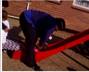
Fun in the sun