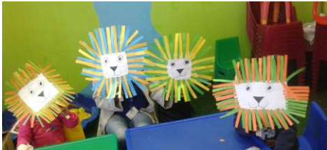
Daniel in the Lions den