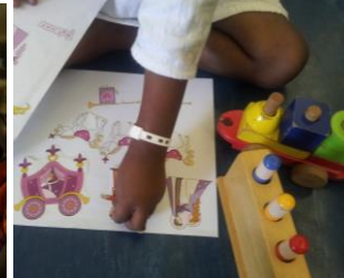
Princesses & Stickers