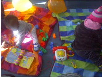
Toddlers Play stimulation

Come and stick, paste, paint, play, glue, listen, learn, laugh, grow, heal and hear the Great news of a Father whose love for you will never end!