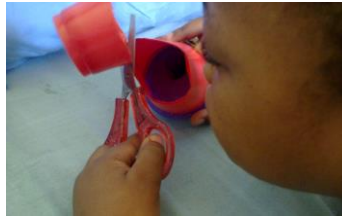
David & Goliath