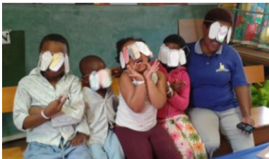
Jars of Oil