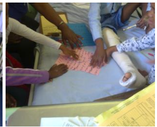
Memory Verse Puzzles