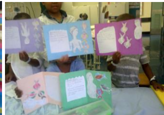
The Prodigal Son