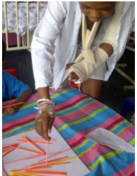
Pick up sticks