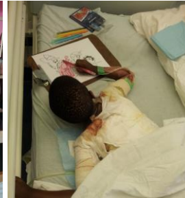
Pushing through Pain to Play