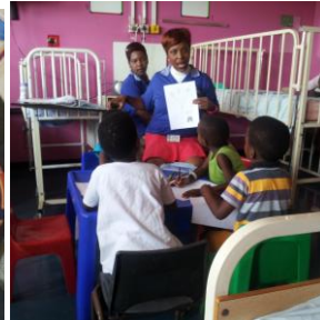
Teaching & Learning