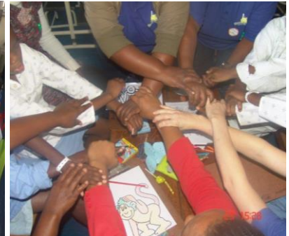
Child Protection Week- In Partnership with the Social Work Department