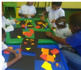
The Story of Creation

"Come children, listen to me and I will teach you the fear of the Lord"