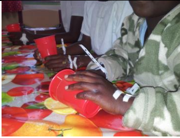
David and Goliath